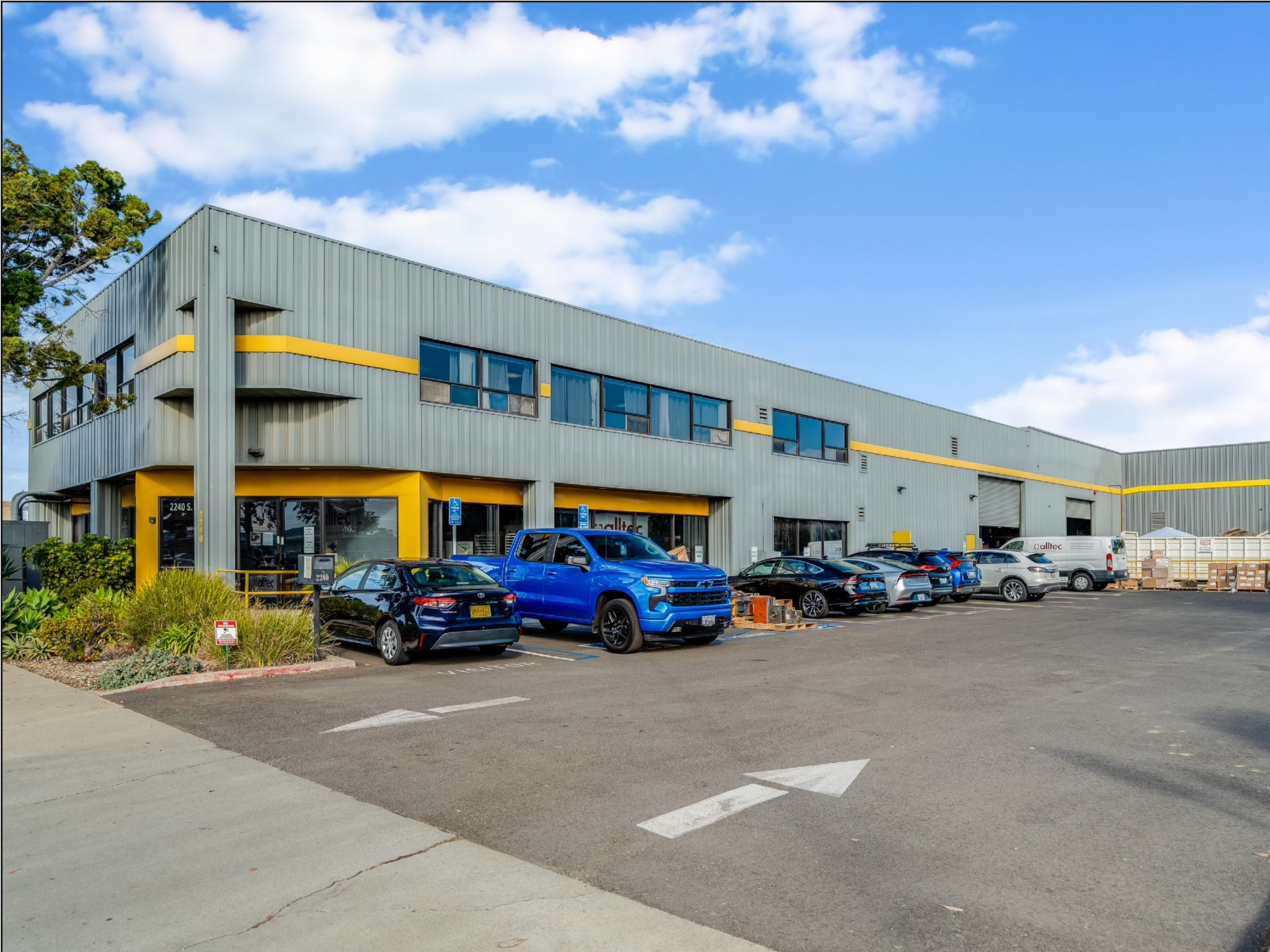
The information contained herein has been obtained from the owner of the property or from other sources deemed reliable. We have no reason to doubt its accuracy, but we do not guarantee it.

To receive more information please call or email us. Our contact information is below and we look forward to talking to you.