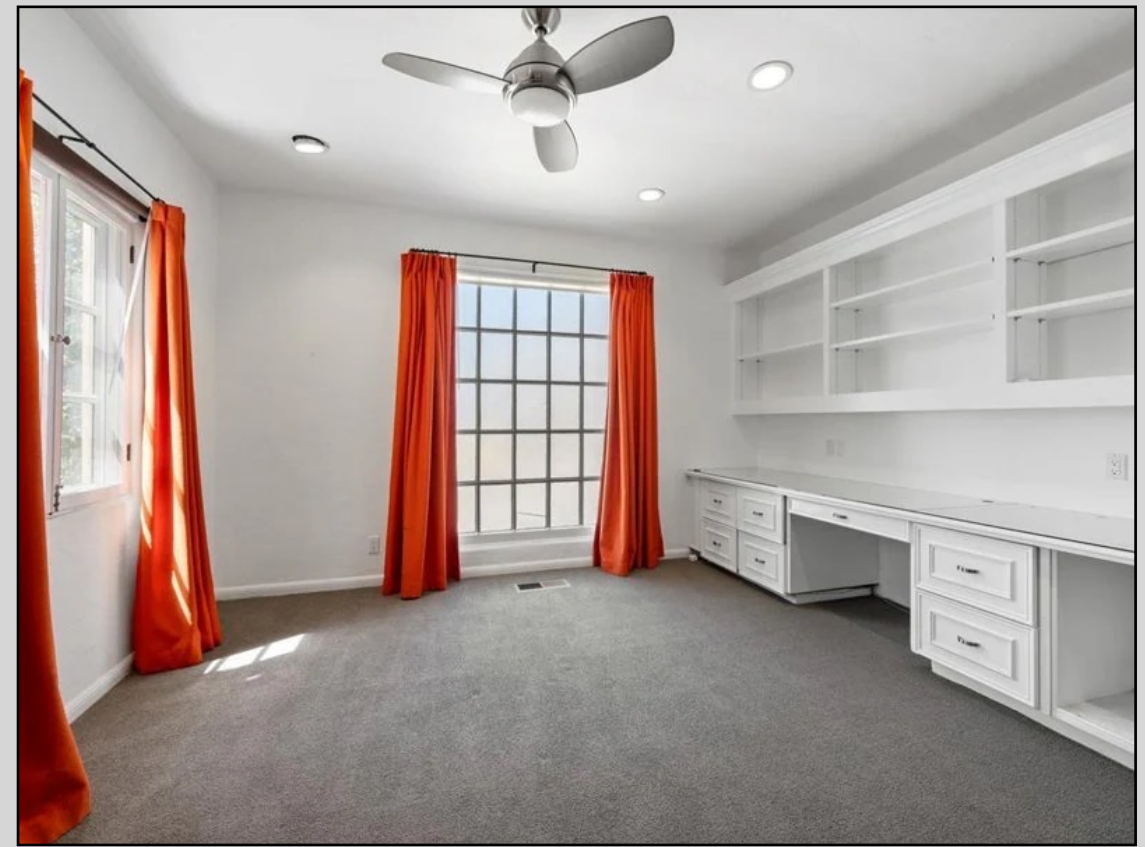
Office with Built-In Workspace