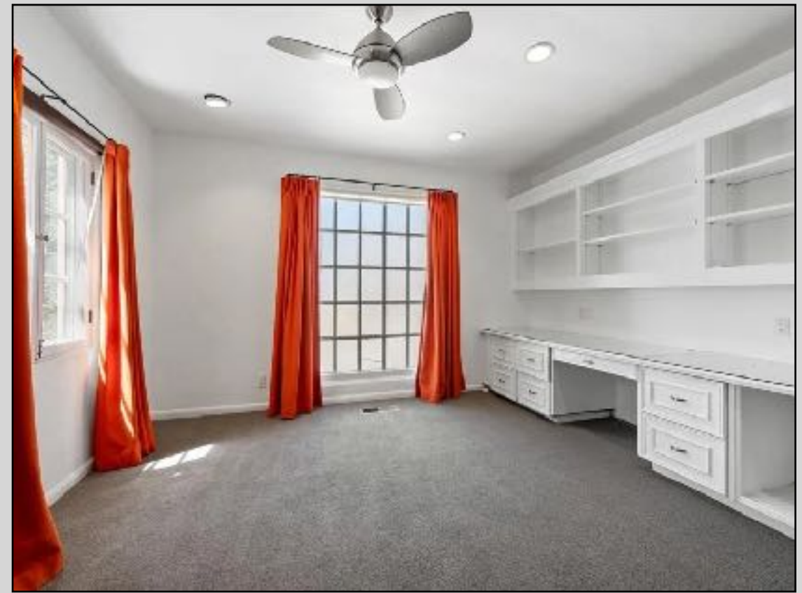
Office with Built-In Workspace