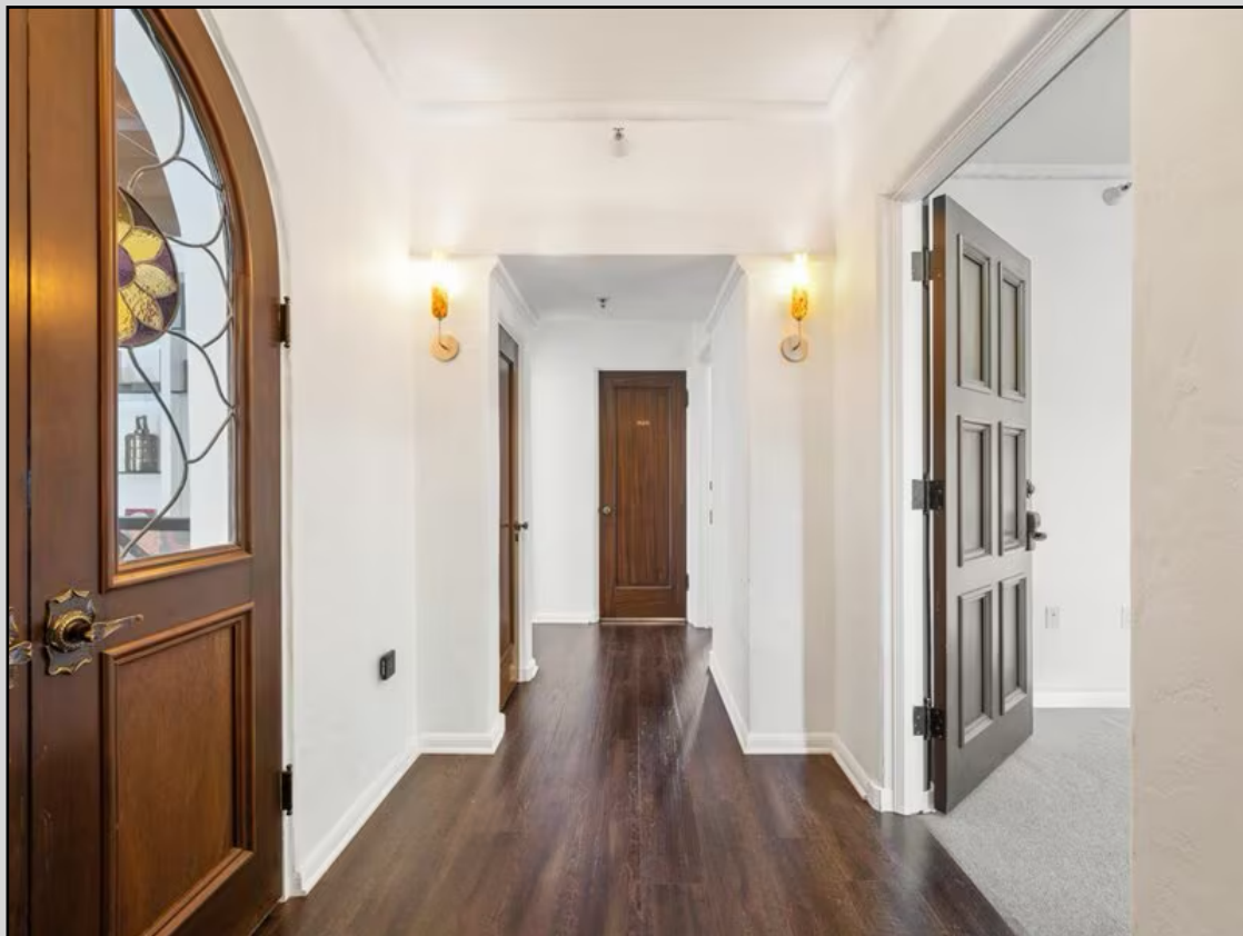
Entry off of Osos St.