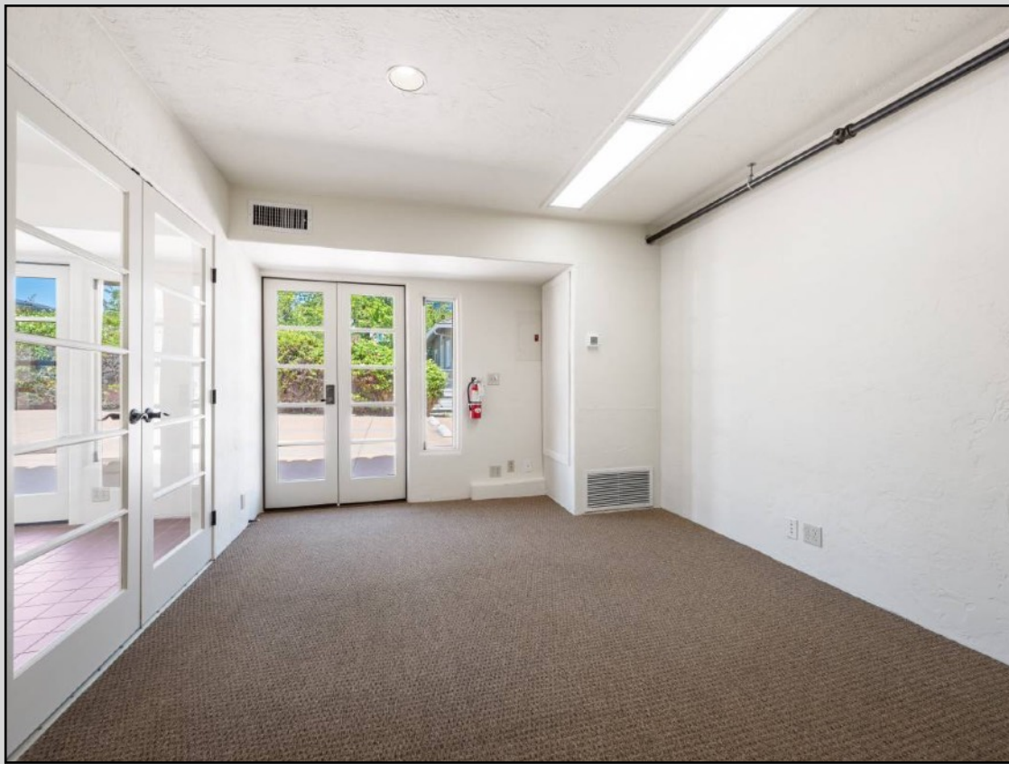
Abundant natural light