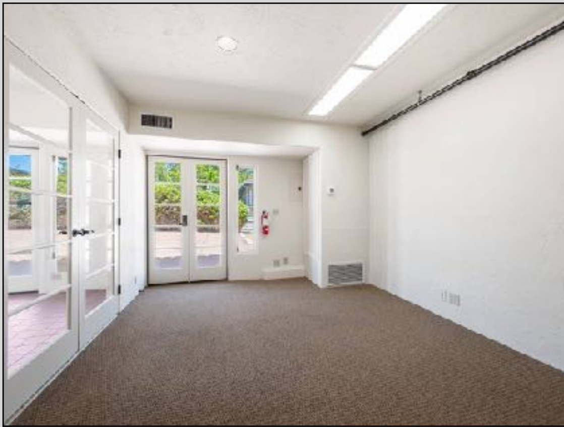
Abundant natural light