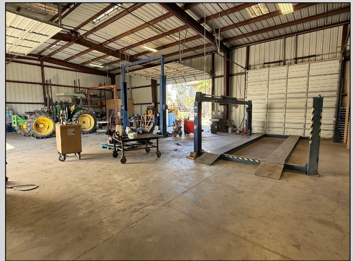
2 rollup doors with drive thru access