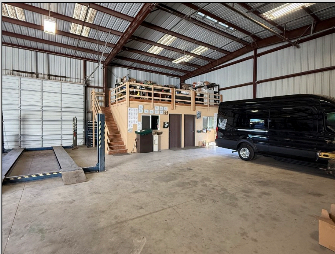
2 of the 3 private offices w/ mezzanine