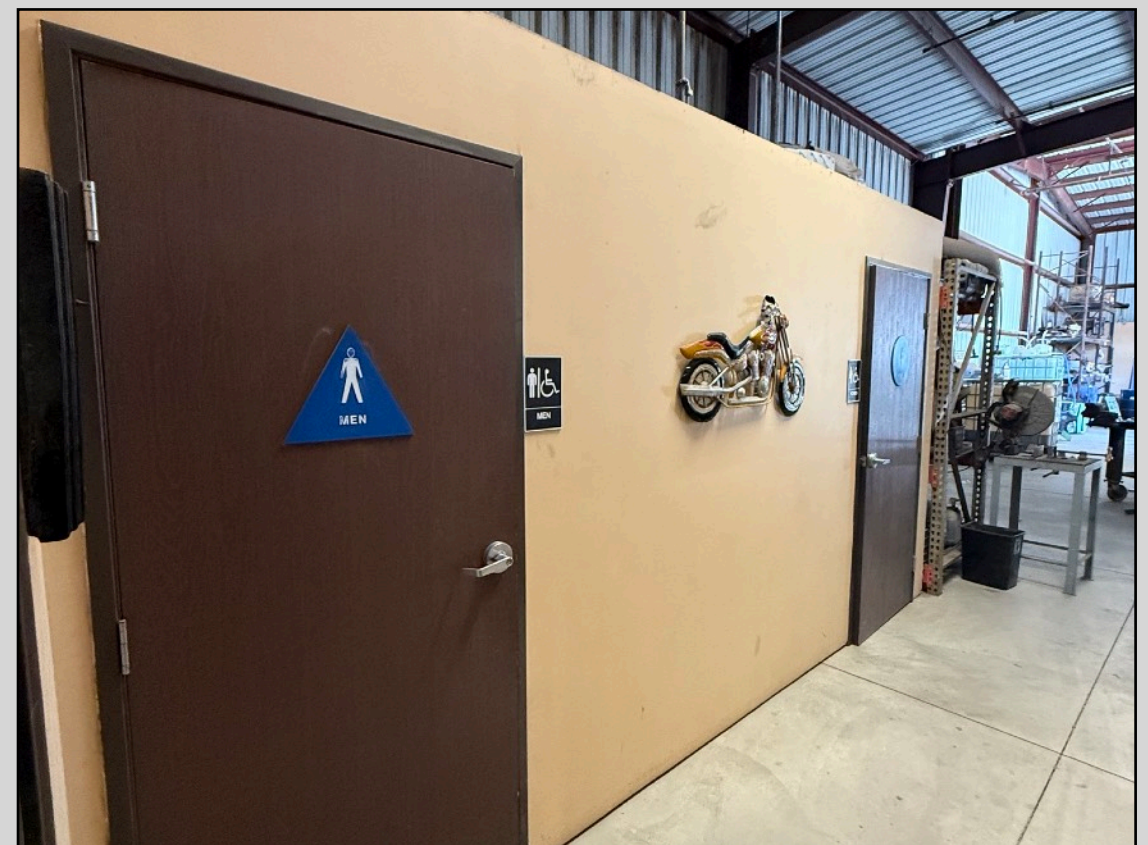
2 well maintained restrooms

Contact: Steve McCarty mccarty@mccartydavis.com 805.431.2671 CalBRE#: 00977930