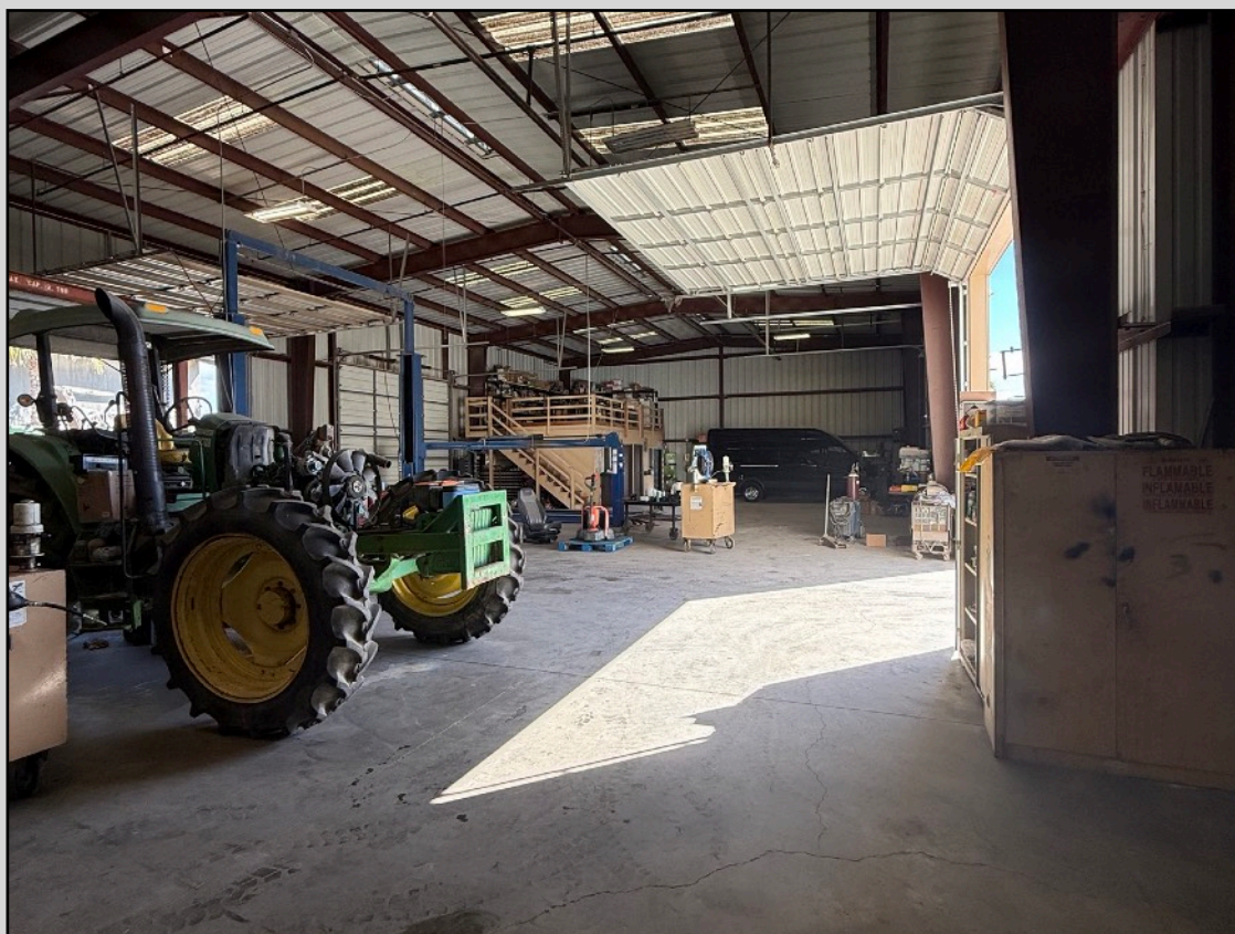
Shop is sprinklered with 18' clear height