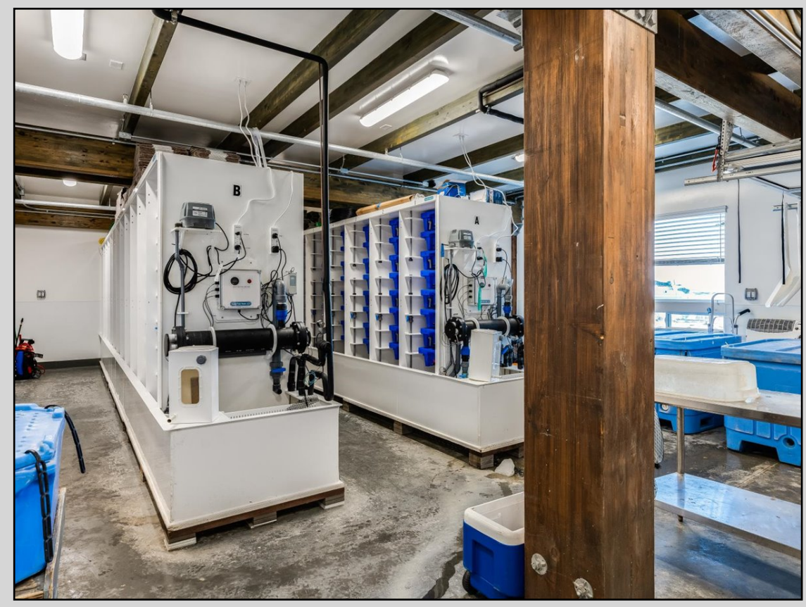
Suite D - Grassy Bar Oyster Company