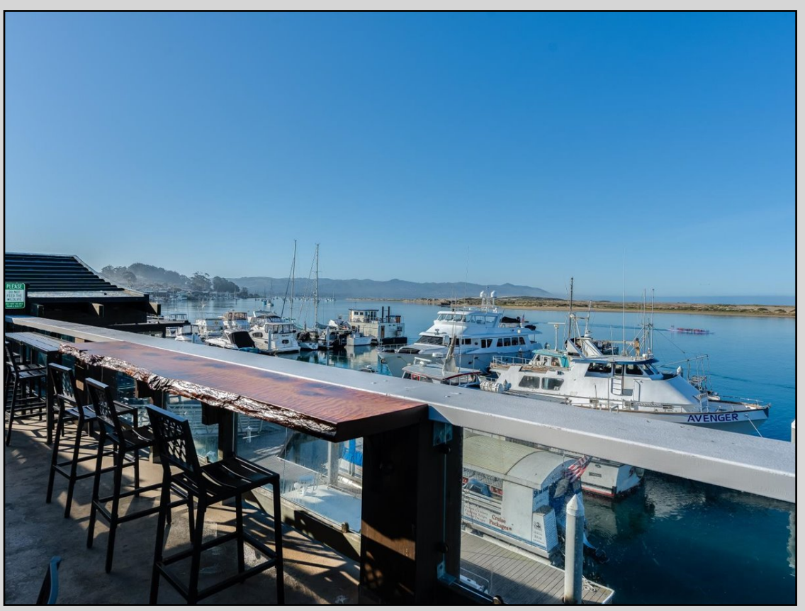
Suite E - Morro Grill