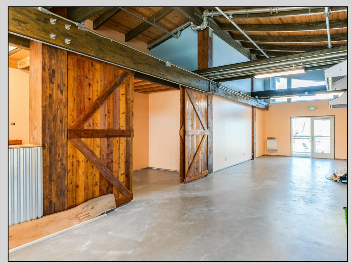
Suite B - VACANT