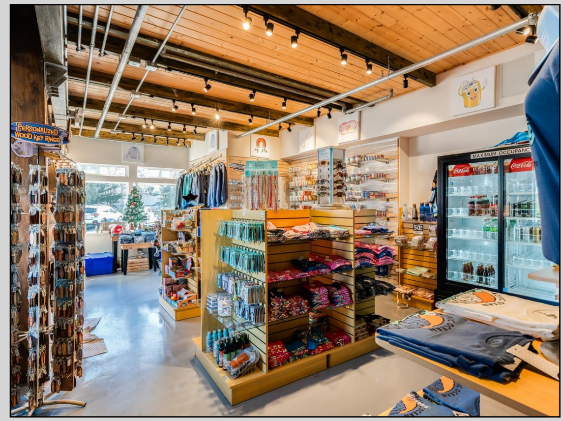
Suite C - Camp One