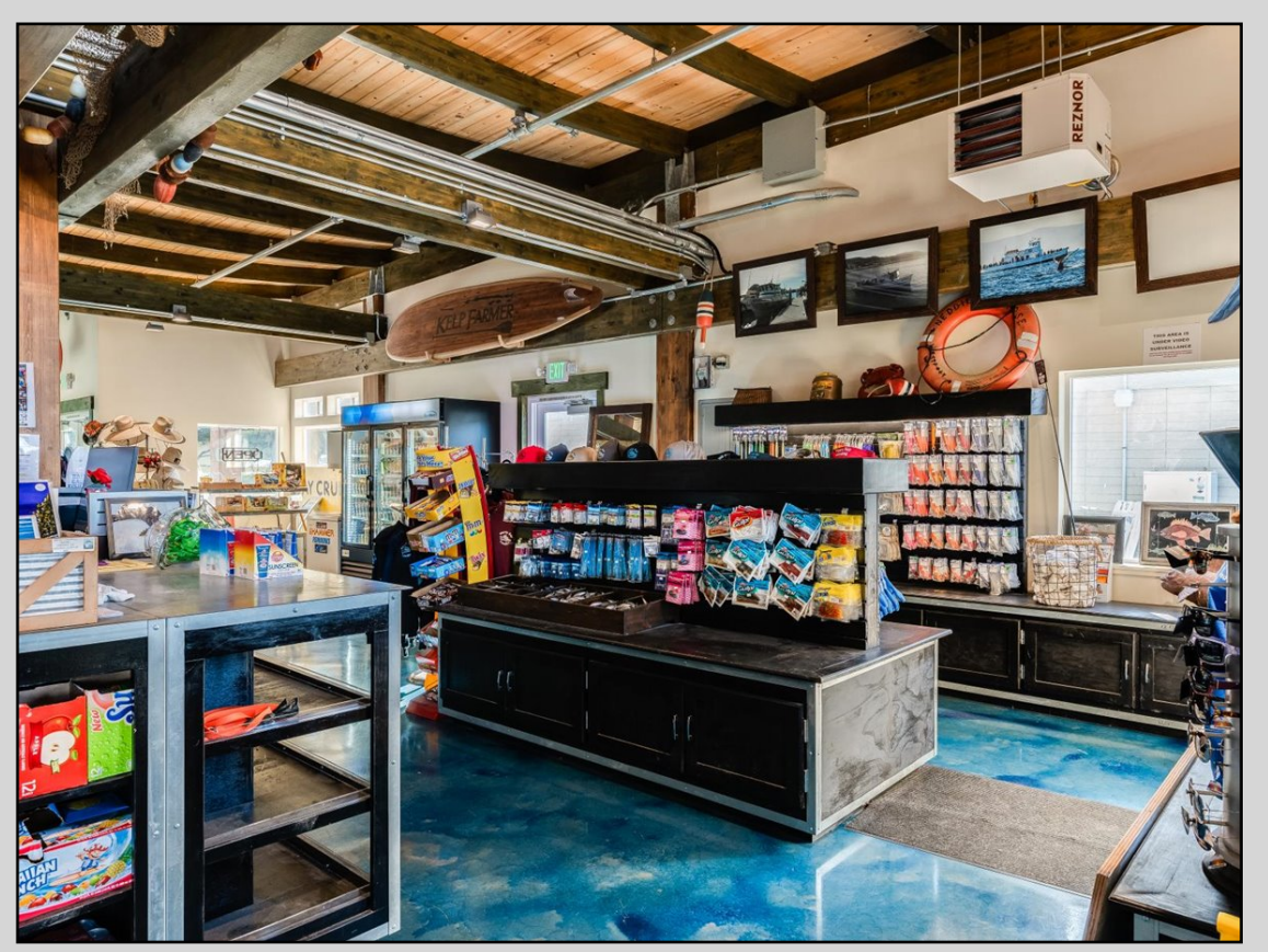
Suite A - Patriot Sport Fishing