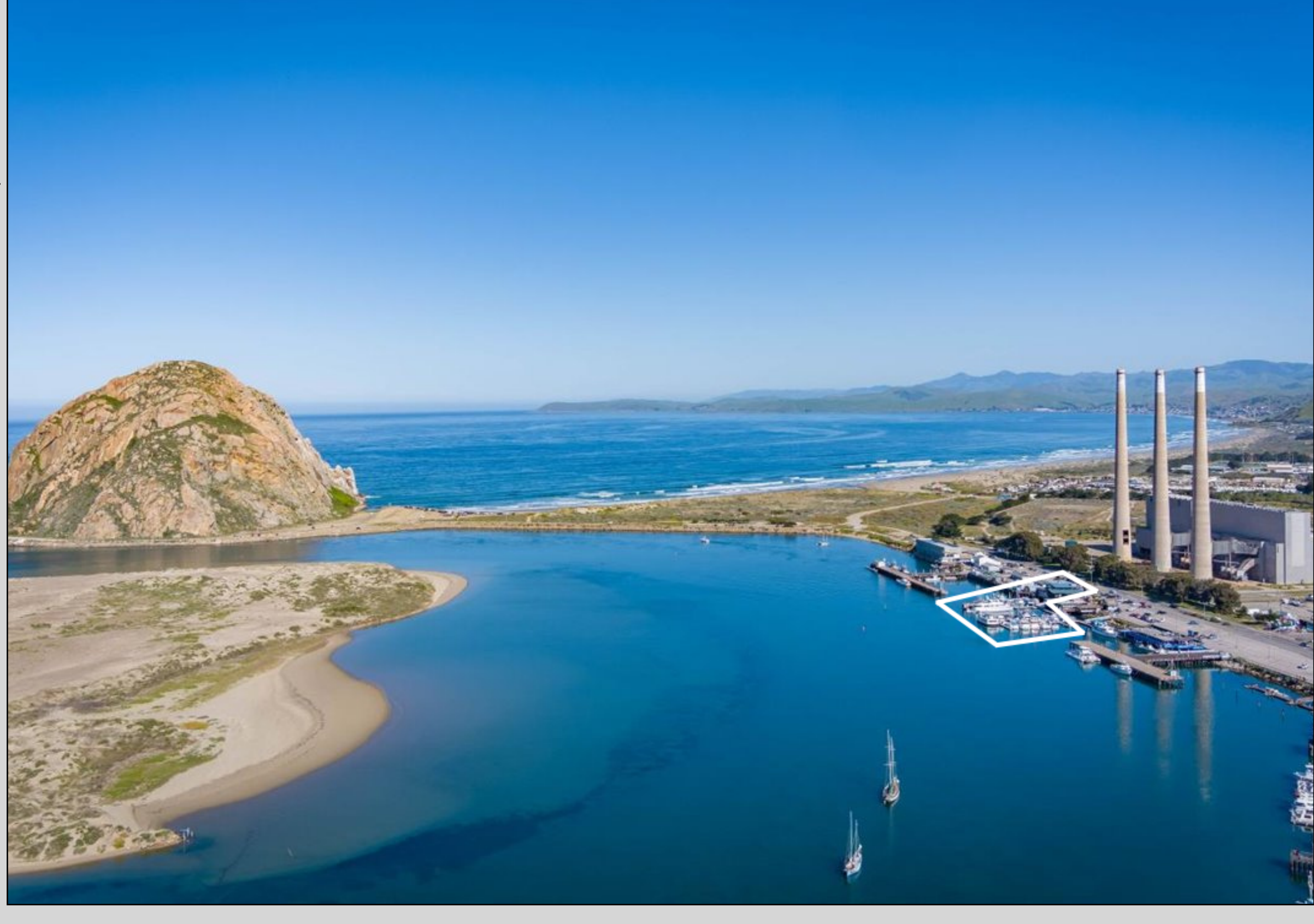
The information contained herein has been obtained from the owner of the property or from other sources deemed reliable. We have no reason to doubt its accuracy, but we do not guarantee it.

To receive more information please call or email us. Our contact information is below and we look forward to talking to you.