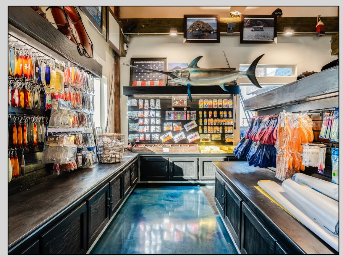
Suite A - Patriot Sport Fishing