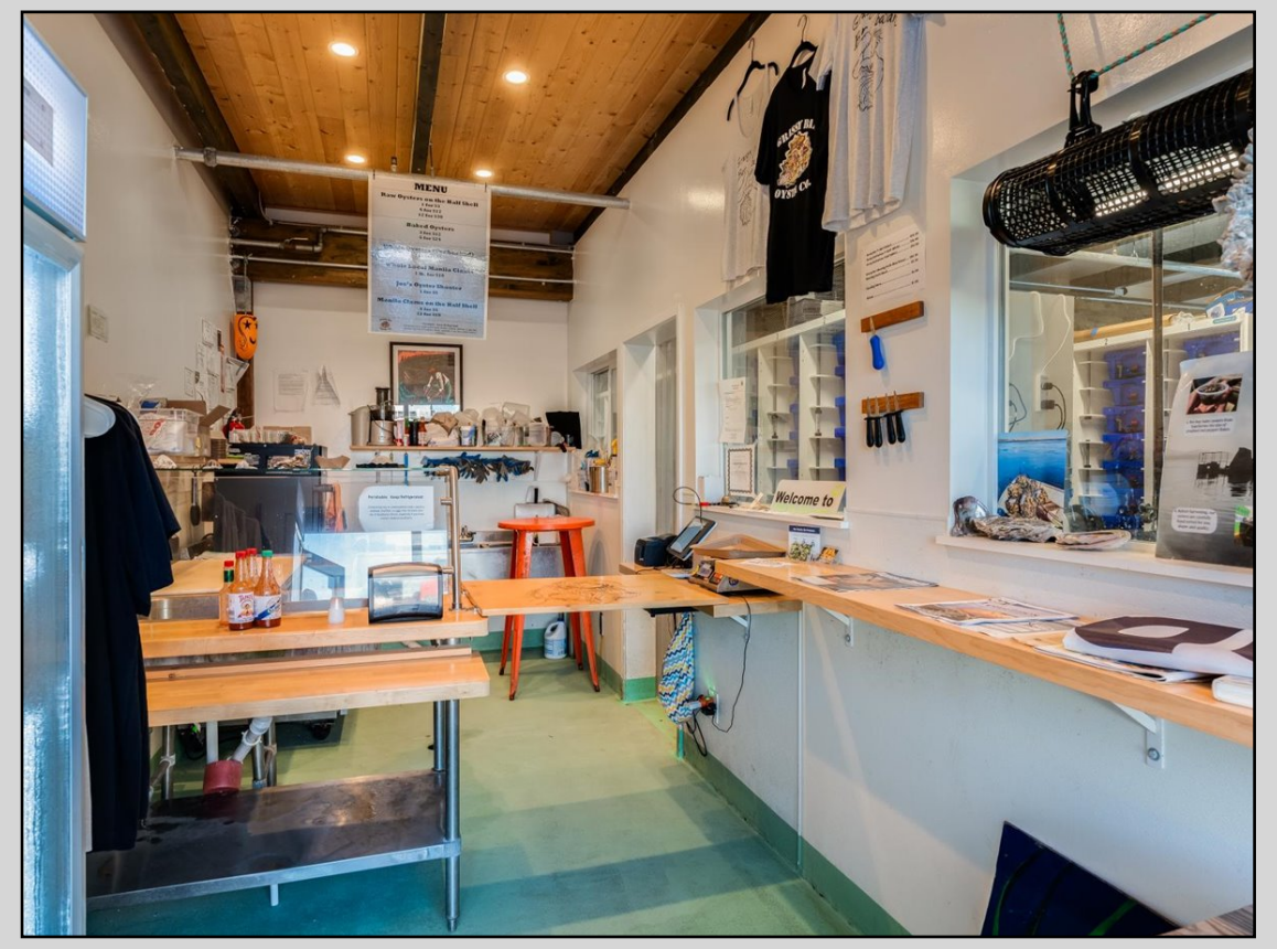
Suite D - Grassy Bar Oyster Company