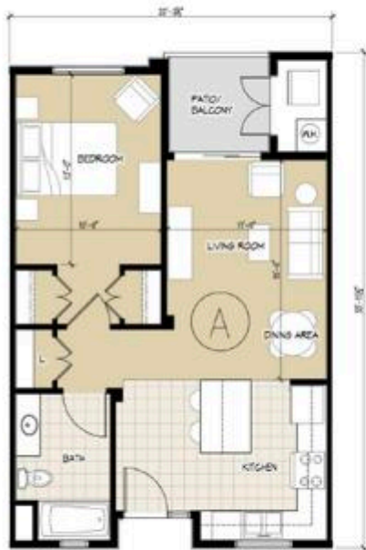
UNIT TYPE "A" - 1 BEDROOM SCALE: 1/4"=1'-0"