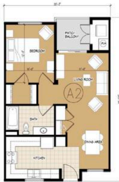
UNIT TYPE "A2" - 1 BEDROOM SCALE: 1/4"=1'-0"