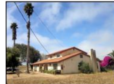
Existing residence on property