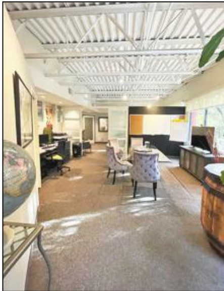
Open Work Space