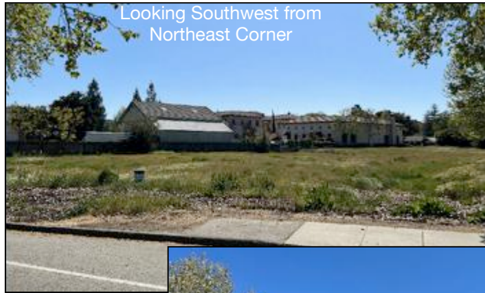
Looking Southwest from Northeast Corner