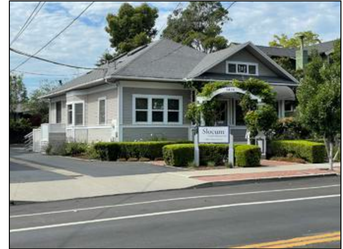
1410 Marsh Street: +/- 6,000 sq. ft. of Land +/- 1,294 sq. ft. of Office