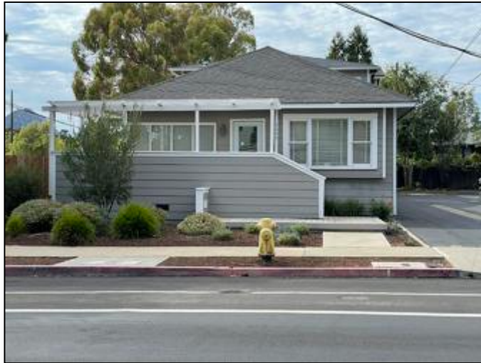
1402 and 1406 Marsh Street: +/- 6,000 sq. ft. of Land +/- 1,096 sq. ft. of Office +/- 1,479 sq. ft. Apartment